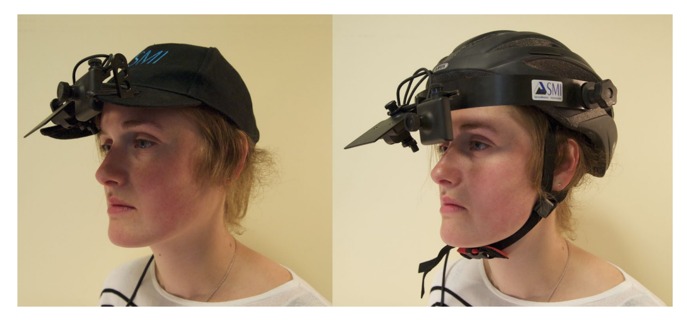
Fig. 1. Photos showing how the eye tracker was mounted in each of the two conditions: to a baseball cap (left) and a bicycle helmet (right).

Either an Abus (Phoenix, AZ) HS-10 S-Force peak bicycle helmet or a Beechfield (Bury, United Kingdom) B15 five-panel baseball cap was used to support the SensoMotoric (Teltow, Germany) head-mounted iView X HED-4.5 eye-tracking device (with its delicate 45° mirror removed; see Fig. 1). Participants responded to the scales using the Bristol Online Surveys Web site. All measures and the BART were completed on a 19-in. 4:3 LCD monitor. The experimenter "operated" an Applied Science Laboratories (Bedford, MA) Eye-Trac 6 desk-mounted optics system with Eye-Trac PC. A fake nine-point